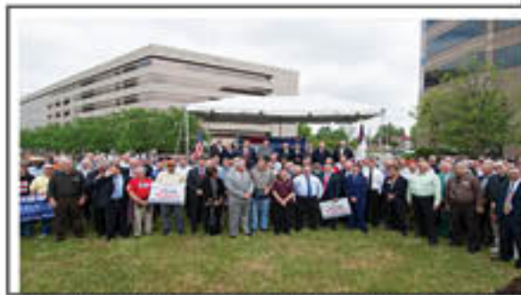
Board of Return America and over 110 pastors who attended