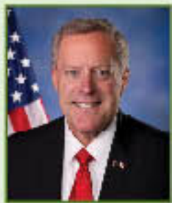
Congressman Mark Meadows 202-225-6401 www.meadows.house.gov

As we approach Thanksgiving – probably my favorite holiday of the year – I'm reminded of the foundational principles and values behind this time of year that are so applicable even today. These principles go all the way back to the beginning of our country, when at the request of both houses of Congress, George Washington proclaimed the first "day of public thanksgiving and prayer, to be observed by acknowledging with grateful hearts the many and signal favors of Almighty God."