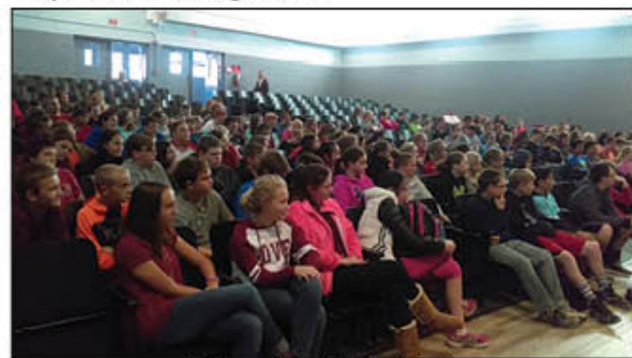
Students at Harris Middle School