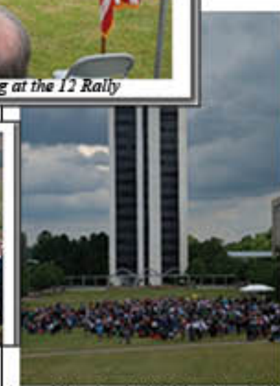
Assembling for the '11 Marriage Rally