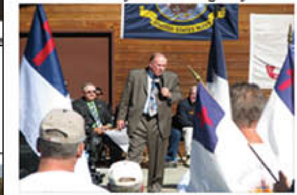
The mile march from Calvary Baptist Church begins to the Veterans' Memorial-4,000 strong