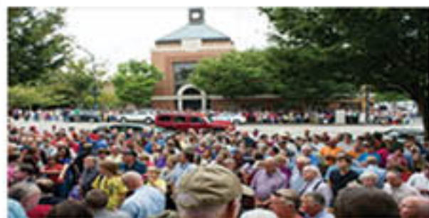
Rally in Rowan 2013