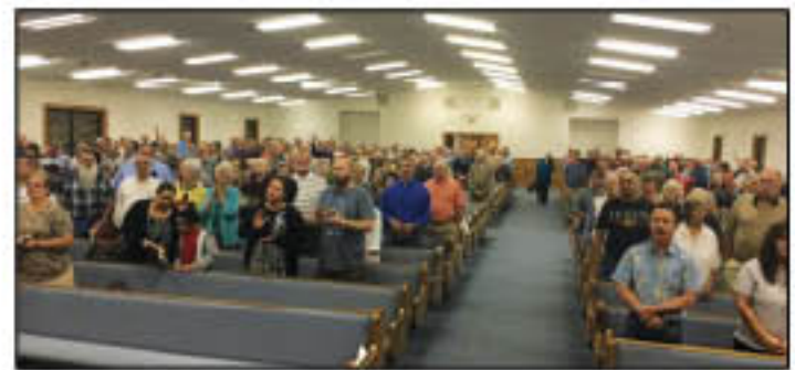
Packed crowd at Tri County Tabernacle

May we see the great significance of these verses as we live our lives today? We certainly need sound Bible preaching back in our Pulpits all across our land. God give us some Men