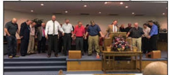
Pastors who came to front to pray

May God help us to stand up and defend the innocent unborn babies that are being sacrificed to the gods of choice and convenience? May we see how