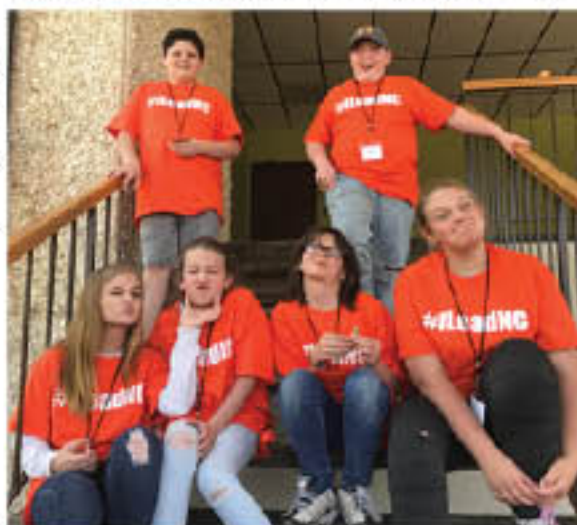
Youth to Youth members pictured at the Youth Leadership Summit in Hickory, NC.