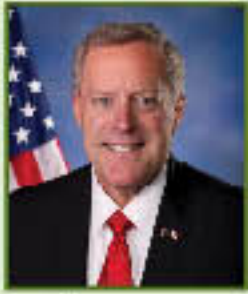
Congressman Mark Meadows 202-225-6401 www.meadows.house.gov