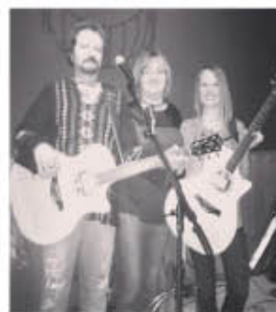
The Odom Family